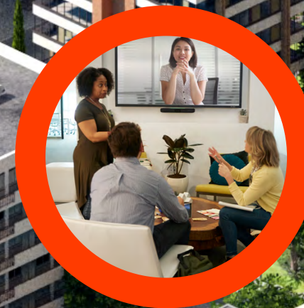
THE HUDDLE ROOM