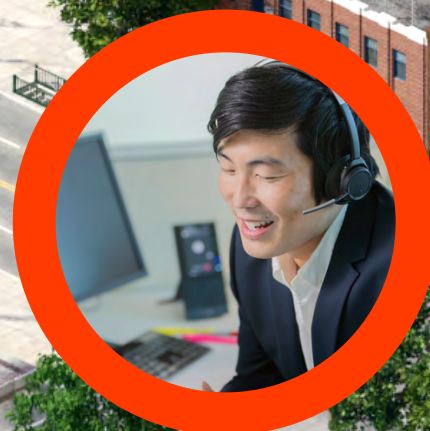
FIT FOR PURPOSE HOME OFFICE