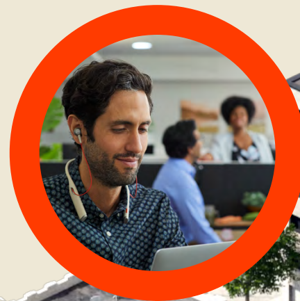
THE OPEN OFFICE