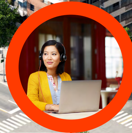
ADHOC HOME OFFICE