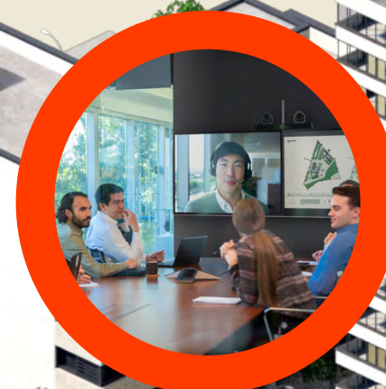
THE BOARD ROOM