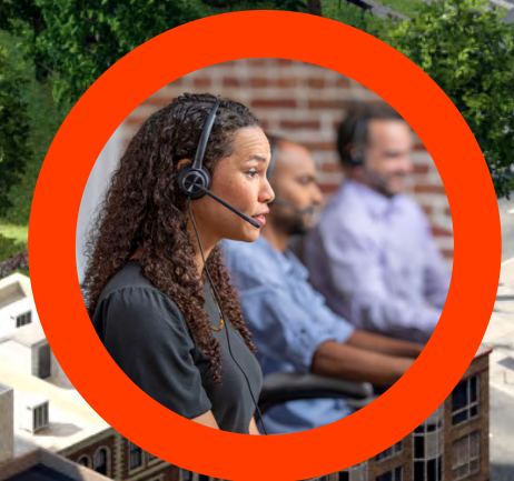
THE CALL CENTER